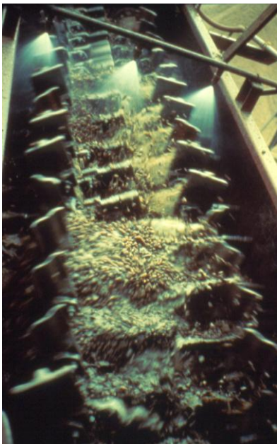
Full Load on a Log Washer

Compared to other types of scrubbing or abrading machinery, Log Washers apply virtually all of their power to the aggregate being processed.