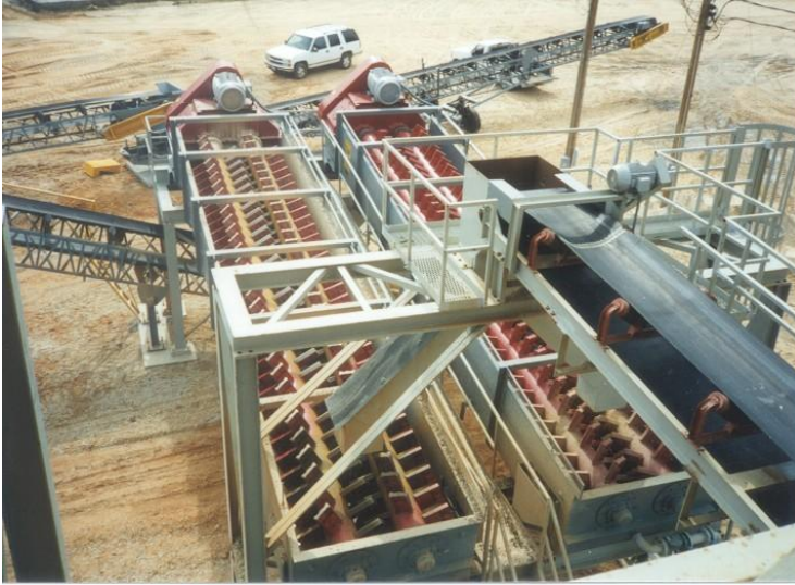
Two Log Washers

The counter-rotating log shafts have intermeshing paddles that provide maximum scrubbing. The paddles subject the aggregates to constant abrading and grinding, which scours the material and breaks down material that is not competent.