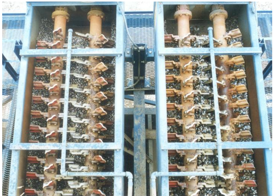
Two Log Washers in action